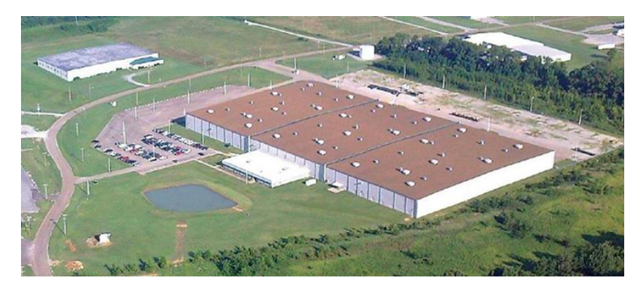
MacLean factory in Trenton, TN

The Strandvise product is the "original" automatic connector, and the only product "Made in the USA". Every product is stamped with a date code for traceability. Accept no substitute!